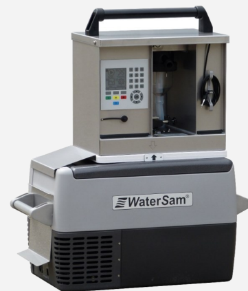
WS Porti 1T - 12T